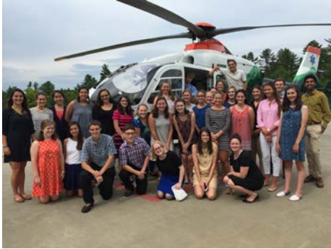
Students learn from the DHART Team!