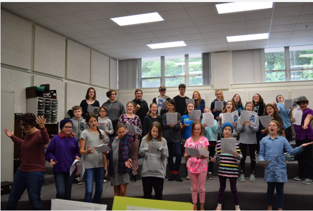
The combined chorus show us their character during a rehearsal.

2018 has been off to a fantastic start with the implementation of a couple of new programs! For the first time we have a full combined middle and high school chorus at WLC! This chorus is comprised of around 40 students and is a sound powerhouse. The students have been working hard to adapt to the new group environment and in no time at all have created a group sound that is absolutely incredible. In addition to the full chorus, we have our first large middle school band with more than 20 students. Growing from a 5th grade music level to an advanced middle school level has been a challenge, but the group has really come together and surpassed our expectations. Finally, as well as these new groups we have created an advanced middle school band with five students meeting once a week to practice new instruments and more challenging repertoire. With the implementation of these new groups and the growing number of students interested in participating in the various musical groups here at WLC, I have never been more excited for a school year and future school years! Don't forget our first concert will be held on Wednesday, December 19 at 6:30pm in the cafe. We hope you can make it; it will be a night to remember!