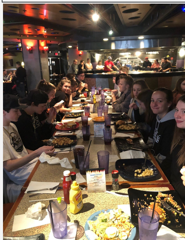
Hungry students enjoy lunch at Fire and Ice after a long, chilly walk.