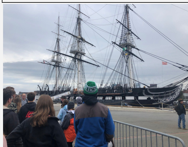
Students board the USS Constitution for a first-hand look at "Old Ironsides."